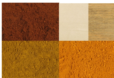
Set B 971

Real Rust, Dark Earth Rusty Brown, Grimy Black