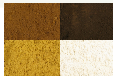
Set C 972

Dark Rust, Quick Age Dry Mud, New Fresh Rust