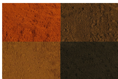
Set A 970

Real Rust, Dark Earth Rusty Brown, Grimy Black