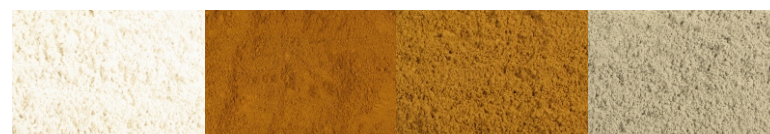
White Wash 984