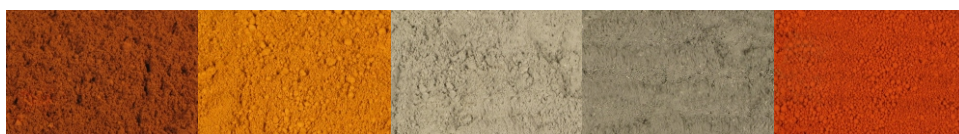
Medium Rust 3108

EASIER TO OPEN AND CLOSE WILL NOT TIP OVER