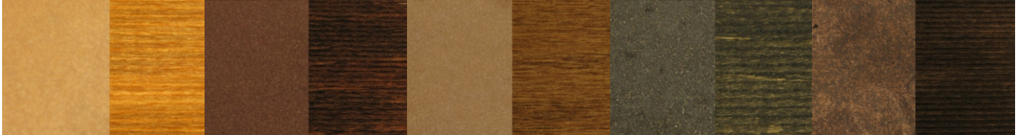
Light Oak 110-350

Samples are colored on white card stock and HO scale basswood clapboard.