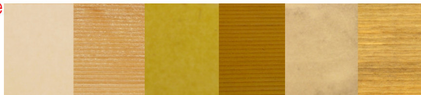
Aged White 110-360

Matches the Famous and no longer available "Floquil" Driftwood.