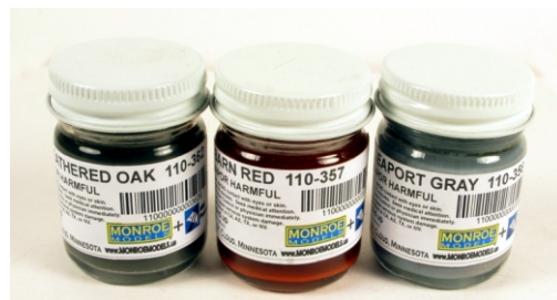
1 oz. Glass Jars

Samples are colored on white card stock and HO scale basswood clapboard.