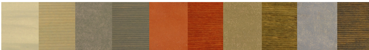
Driftwood Gray 110-355